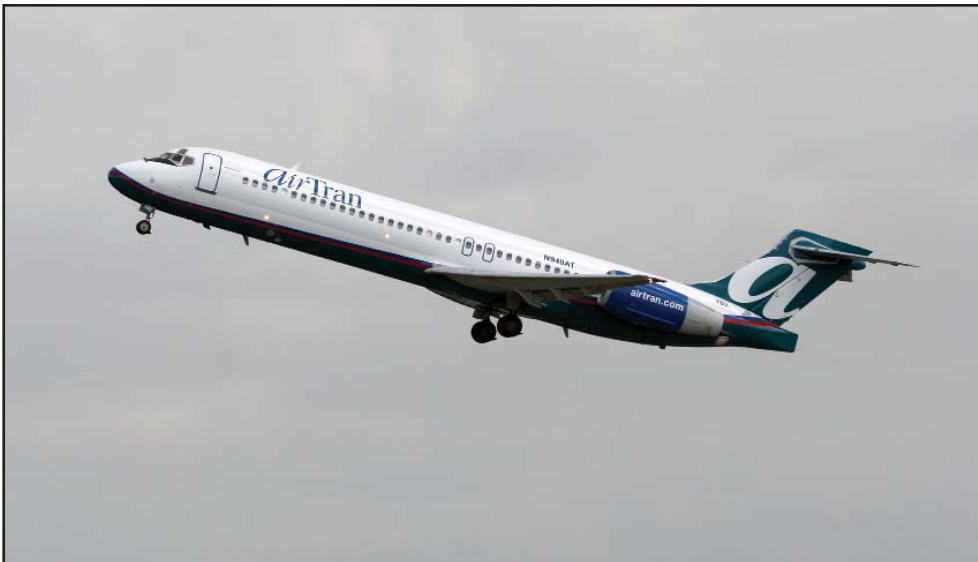
MORE AIRTRAN PLANES IN THE SKIES OVER DAYTONA BEACH Air carrier to increase presence for the busy winter season

The service reduces operating costs and allows luggage to be processed more quickly