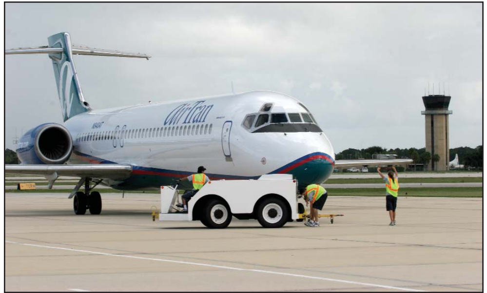
DBIA NOW HANDLES BAGGAGE FOR AIRTRAN AIRWAYS

The service reduces operating costs and allows luggage to be processed more quickly