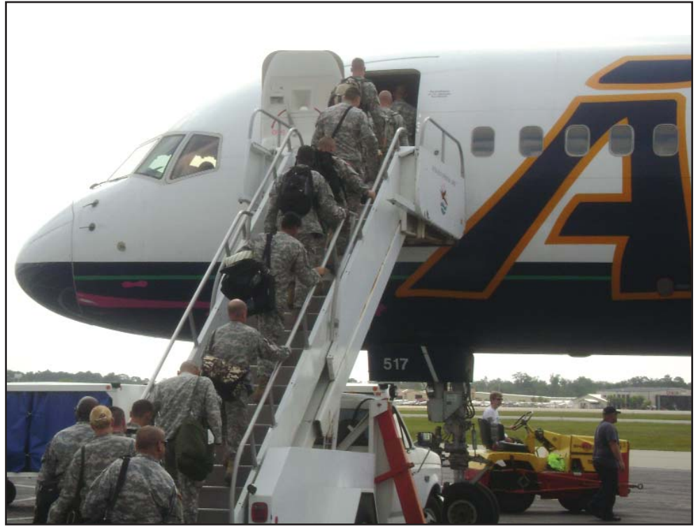
SAYING GOODBYE TO OUR SOLDIERS -- On August 22 local National Guard Troops were deployed for training to the midwest pending final deployment to Iraq. The aircraft was a charter Boeing 757 operated by American Trans Air (ATA).

Complete airport information is on our website at www.flydaytonafirst.com .