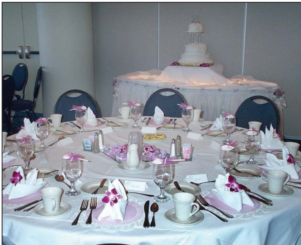
THE TABLE IS SET FOR ANOTHER FUNCTION The Volusia Room is a busy place, hosting several meetings and banquets daily

Another service the airport provides is its mailback program. DBIA is one of the few airports to offer a free mailback service. When the Transportation Security Administration screeners determine that an item cannot be carried onboard the aircraft, the passenger is given the option to place the surrendered object in an envelope, address it, and drop it in a collection box