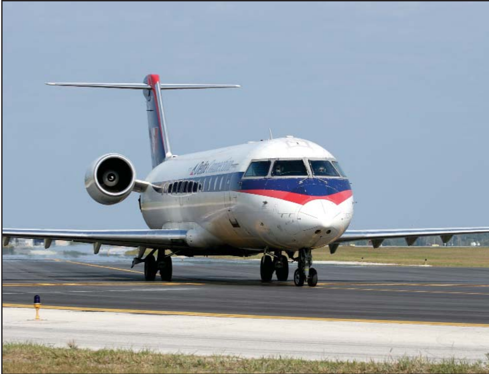
A DELTA JET TAXIES ON TAXIWAY NOVEMBER Taxiway November recently was rebuilt with grants from the FAA and FDOT