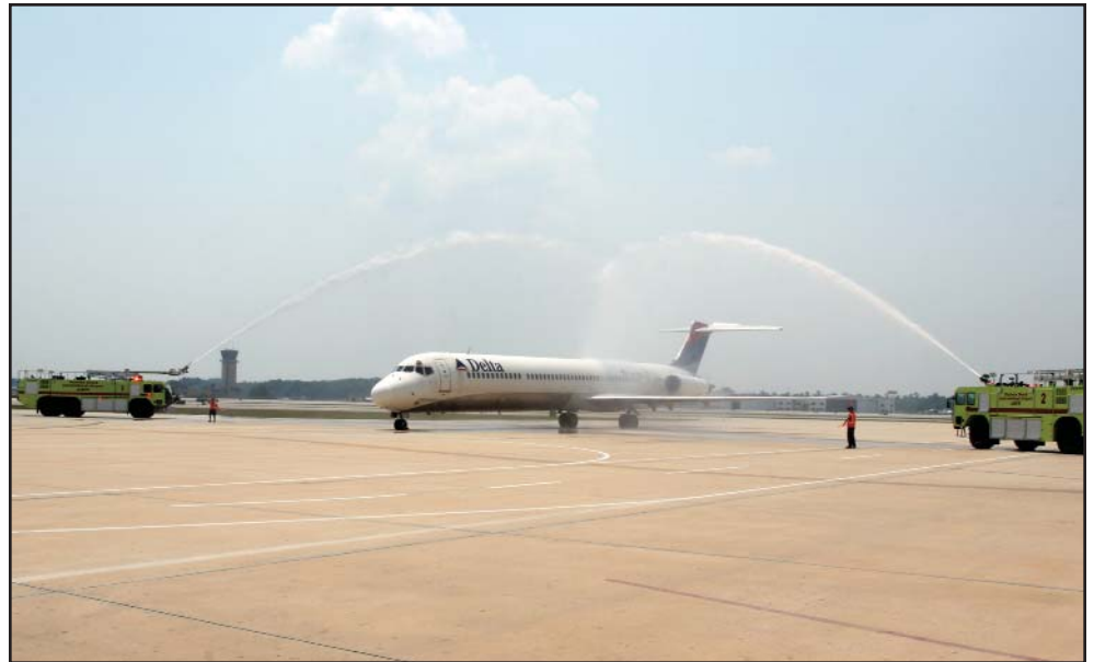
DELTA AIR LINES EMERGES FROM THE STORM A Delta jet is greeted with a water salute at DBIA April 30