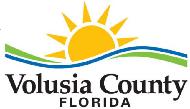
West Volusia Transfer Station