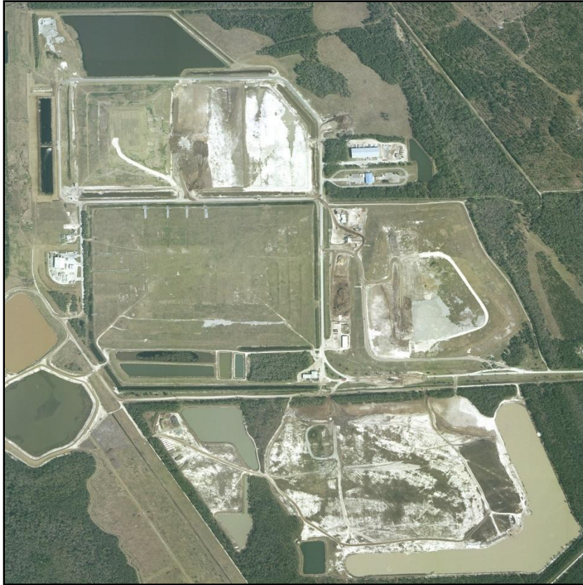
Tomoka Farms Road Landfill