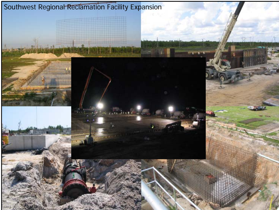
Southwest Regional Reclamation Facility Expansion