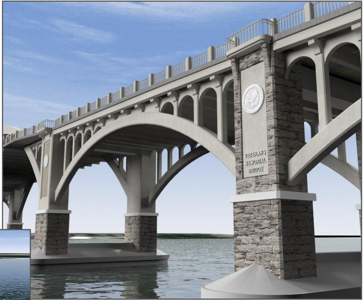
Detailed view of overlooks on pages 7-9

Would add $343,000 to Option A bridge cost estimates