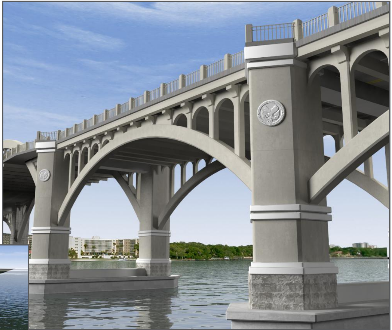
Detailed view of overlooks on pages 7-9

Would add $868,000 to Option A bridge cost estimates