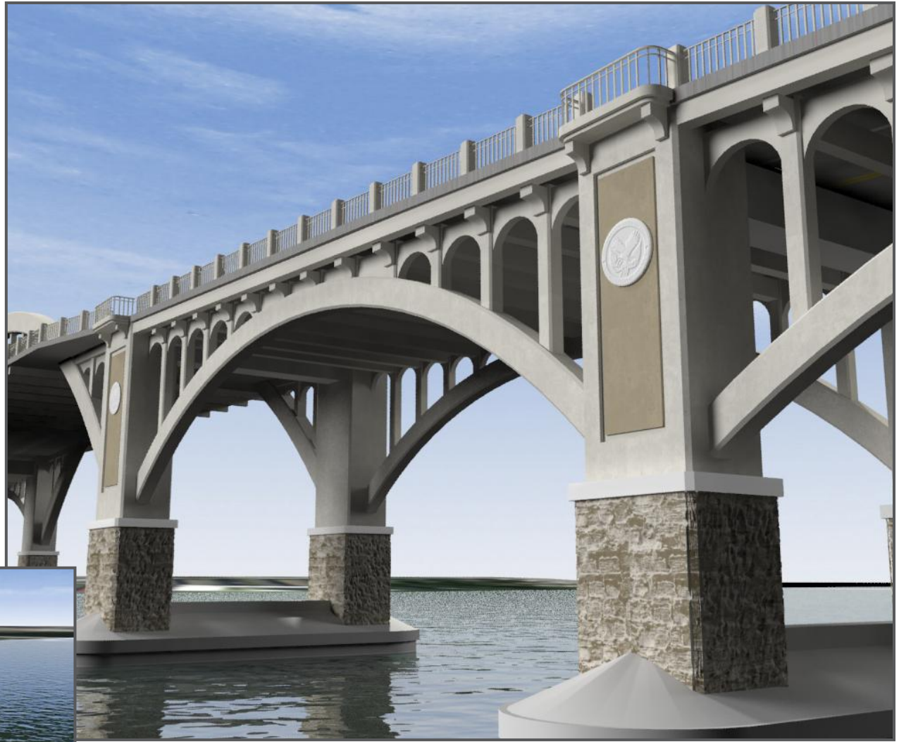
Detailed view of overlooks on pages 7-9

Included in current Option A bridge cost estimates