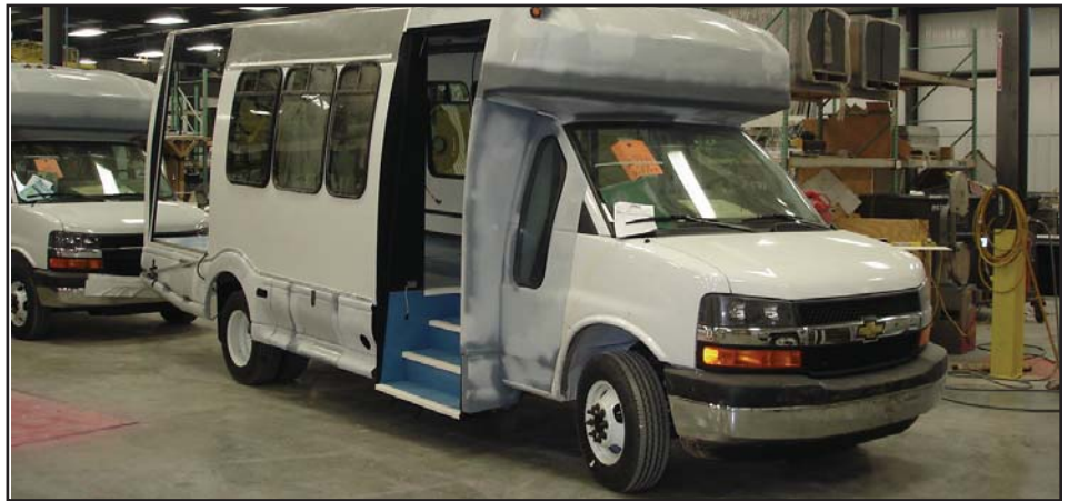
PARATRANSIT HYBRID, UNDER CONSTRUCTION, IS EXPECTED IN EARLY 2010. The hybrid, developed by TurtleTop and Azure Dynamics, features a gasoline/electric hybrid power plant on a Chevy chassis.

The paratransit vehicles include five hybrid-gas, 22-foot cutaways from TurtleTop which are expected in January. Another five 25-foot paratransit vehicles are being built to Florida Department of Transportation specifications for a hybrid-diesel model and hybrid-gas model, and are expected to be in use early in 2010.