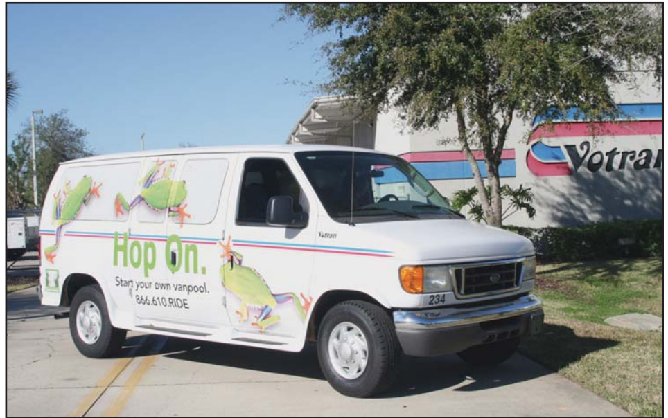
LAST YEAR, VOTRAN VAN POOLS SAVED COMMUTERS 160,447 GALLONS OF FUEL Commuters can save on taxes too

The IRS code and the Transportation Equity Act for the 21st Century (TEA-21) allow employers to offer workers the opportunity to set aside earnings to pay for certain transportation expenses, such as van pool costs, bus passes and tokens. Employees will not be taxed on amounts set aside and used for qualified expenses.