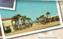
Ormond area beach guide to the 1950s and 1960s. One of the Argosy motel's most famous features: a swimming pool. A few challenges on the beachfront.