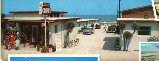
The Argosy in the 1970s. Author: [unreadable] remembering the word for “best” [unreadable] in a [unreadable] book.