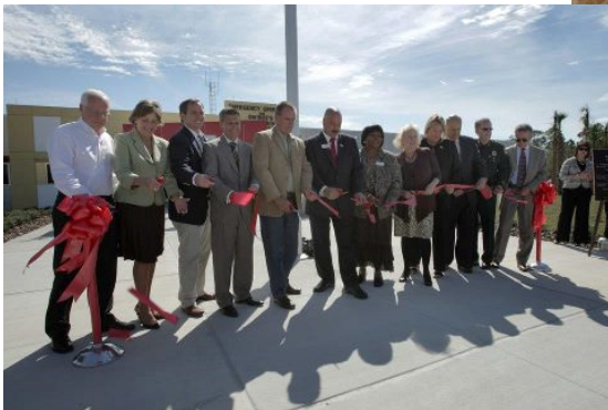
Cut the ribbon on the New Emergency Operations and Communications Center; ate some fine Chili at the Enterprise Preservation Society Chili Cook-off;