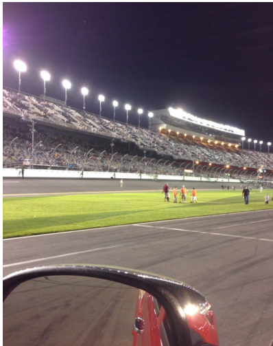
How cool is that!