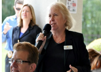
Addressing the Delegation in Tallahassee