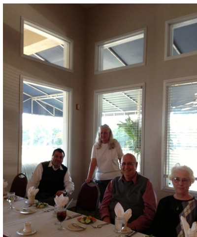
Thank You DeBary Library Volunteers for all your work!

Panelist in the Walter Boardman Environmental program on emergent issues in land management; attended the DeLand Chamber of Commerce State of the Region Luncheon and provided color commentary for WSSB Radio; Brought greetings to the DeBary Pubic Library Annual Volunteer Recognition Dinner, shot film for a documentary on