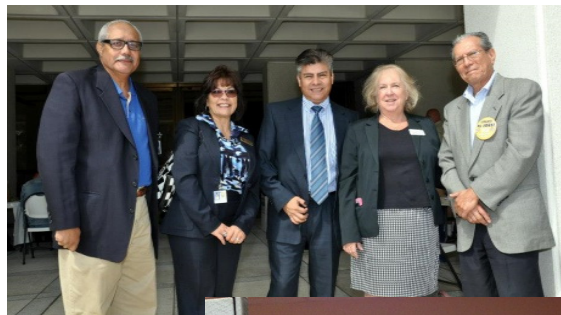
Members of the Volusia Hispanic Chamber of Commerce in Tallahassee for Volusia Days. Working for all of us!

political service with the Daytona Chamber's Leadership Class; attended the County Council Retreat;