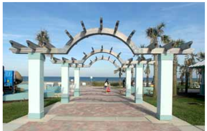
Frank Rendon Park, Daytona Beach Shores

This popular park encompasses 52 acres of pristine land on the north side of Ponce DeLeon Inlet. The park features nature trails, an observation deck and tower, and picnic area. Admission is $5 per vehicle ($1 per person if the vehicle seats more than eight).