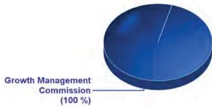
Division - FY 2022-23