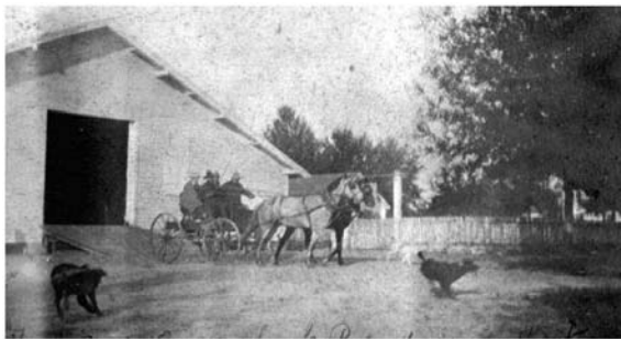
Off on a hunt