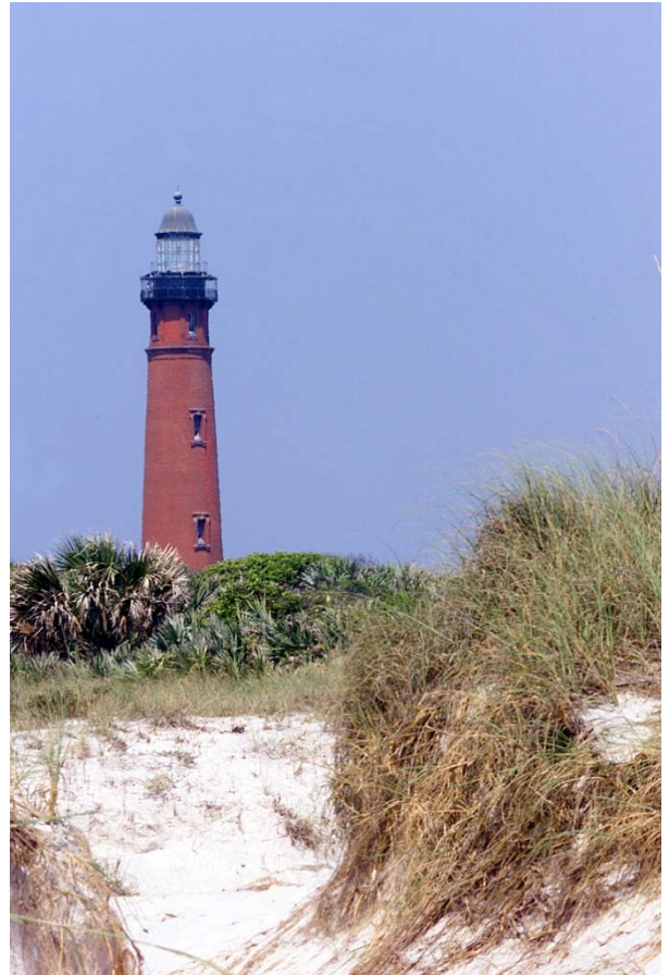
The lighthouse at Ponce Inlet

To see our current job opportunities, please click here.