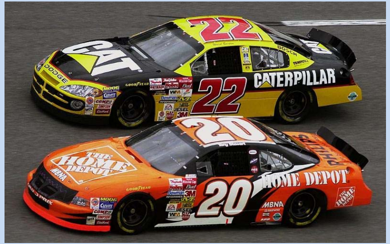
Racing at Daytona International Speedway