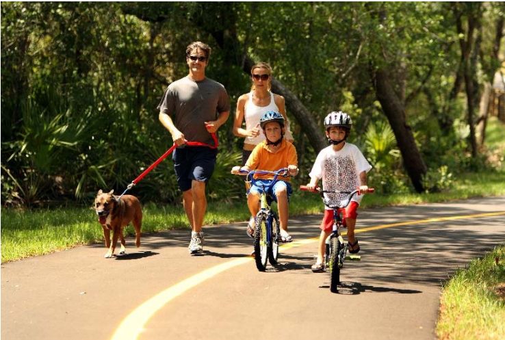
Run, walk or bike on one of our many trails or on the beach (below)