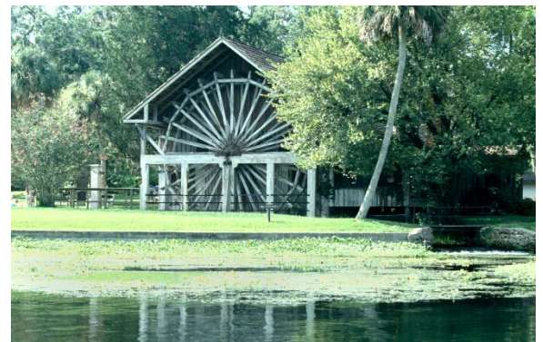
DeLeon Springs State Park

Picnic, boat, swim, hike, camp, bike, hunt, fish – take your pick of the many outdoor recreational and leisure activities that can be enjoyed here year round. Volusia's 47-mile coastline features wide, sandy beaches that frame Daytona Beach and the eastern part of the county. Just offshore, more than 140 artificial reefs provide easily accessible sites for deep sea fishing and diving. The waterways of the Indian River and Mosquito Lagoon estuary also are prime fishing spots with an abundance of fish, shrimp, clams and oysters residing in the shallow waters and salt marshes.