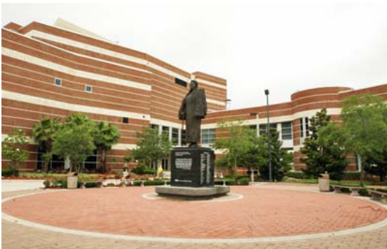
A statue of Dr. Mary McLeod Bethune at her historic namesake university

The school district also has been at the forefront of the innovative Bring Your Own Technology program, aimed at helping students develop 21 st century skills by encouraging them to use their own electronic devices in the classroom to interact with their teachers and each other to research information and solve problems.