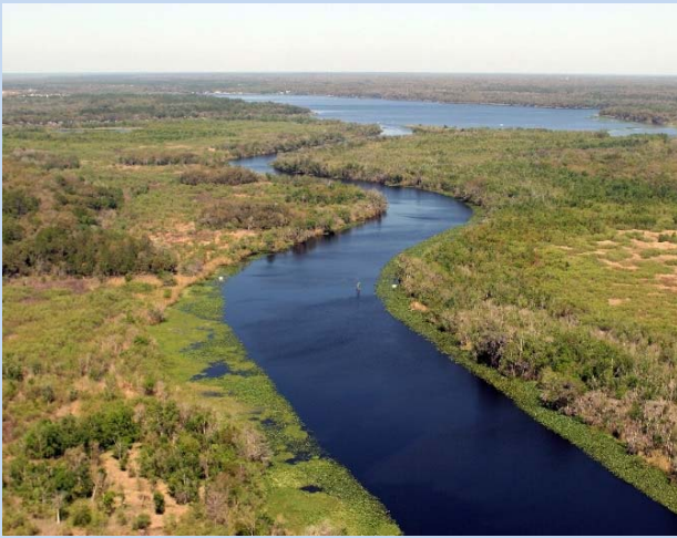
Fish or boat on the majestic St. Johns River