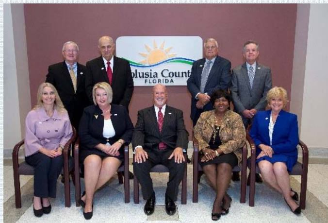
The 2017 Volusia County Council, County Manager, and County Attorney

The County Manager is hired by the County Council and works with its members to assist in formulating policies and programs. The County Manager is the top administrator for approximately 2,700 full-time County employees and is responsible for an annual operating budget of nearly $700 million and the ongoing operations of all County services.