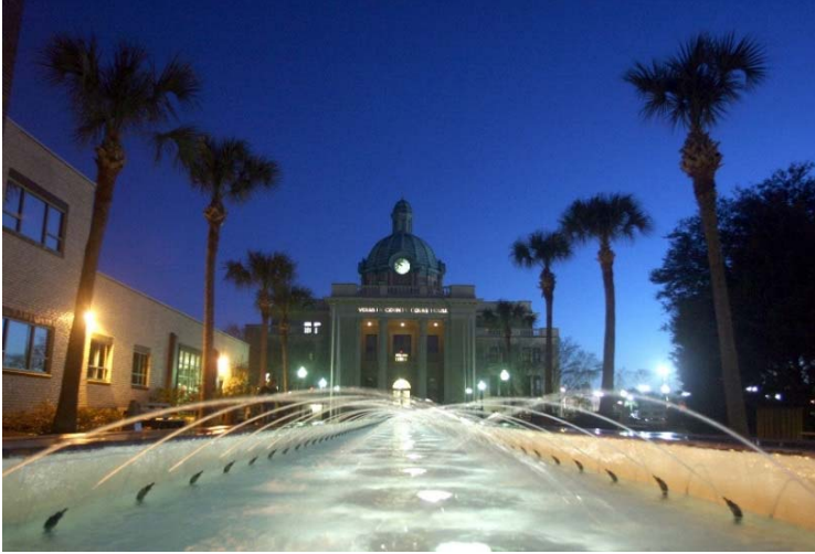
Volusia County Historic Courthouse

Volusia County also provides excellent training and development opportunities. Our Human Resources staff can help you connect with these opportunities and choose which courses are right for your career path.