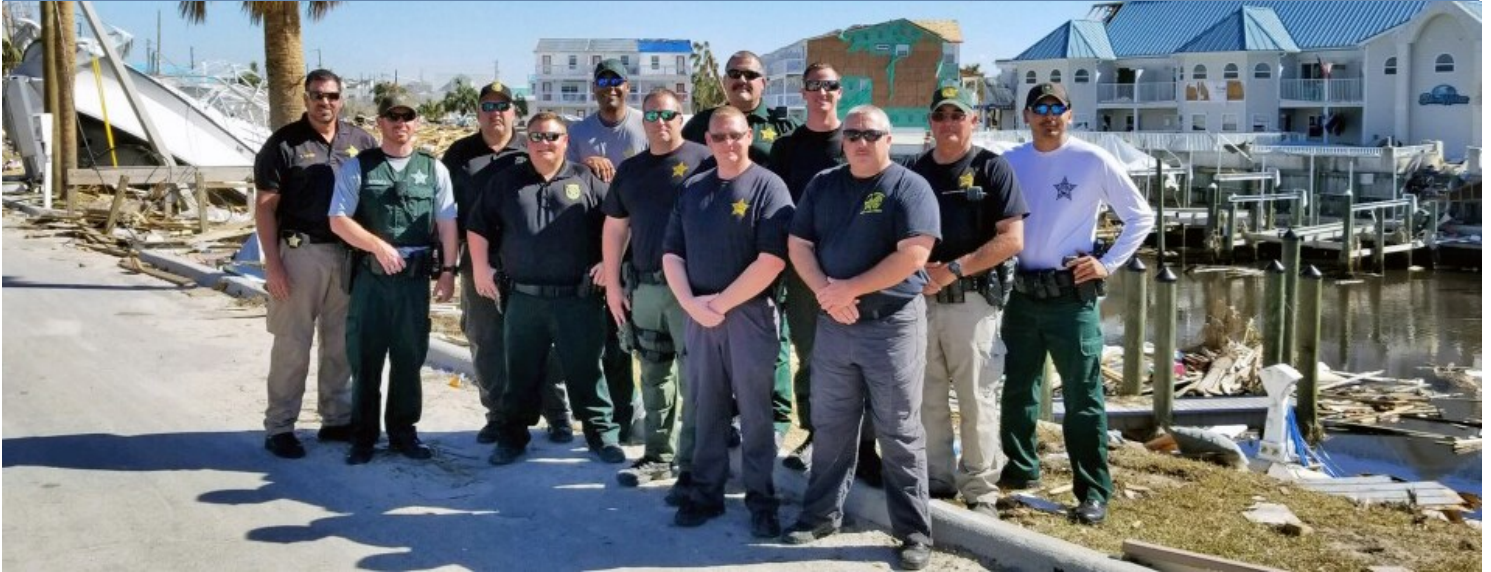
ABOVE AND BEYOND – Deputies from the Volusia County Sheriff's Office joined forces with the Bay County Sheriff's Office to provide law enforcement following Hurricane Michael.