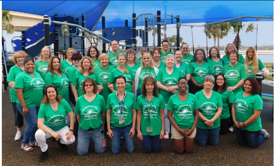
BACK IN ACTION – Library employees pose on the new Rachel Robinson Play Yard at the Daytona Beach Regional Library on reopening day, May 5.