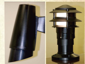
Examples of sea turtle friendly exterior light fixtures from the manufacturer Electro Elf. No one fixture fits all situations with lighting compliance, so make sure to inspect your property at night!

Reducing your energy consumption also lowers carbon emissions affecting climate change.